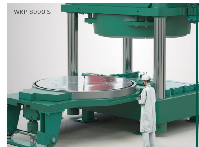
WKP 8000 S