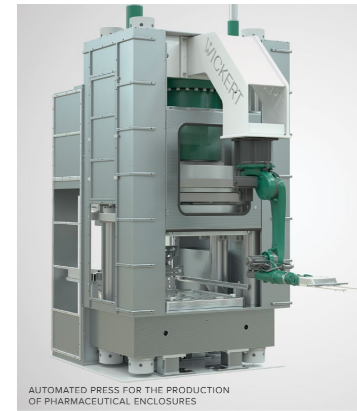
AUTOMATED PRESS FOR THE PRODUCTION OF PHARMACEUTICAL ENCLOSURES

➤ 5 YEAR WARRANTY ON ALL LOAD-BEARING PARTS